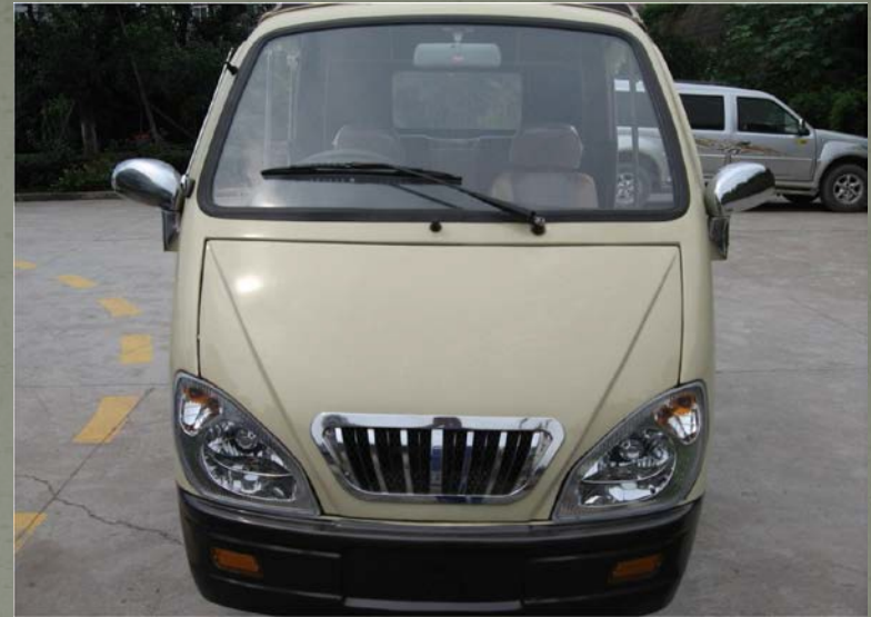
Trident HOT SHOT