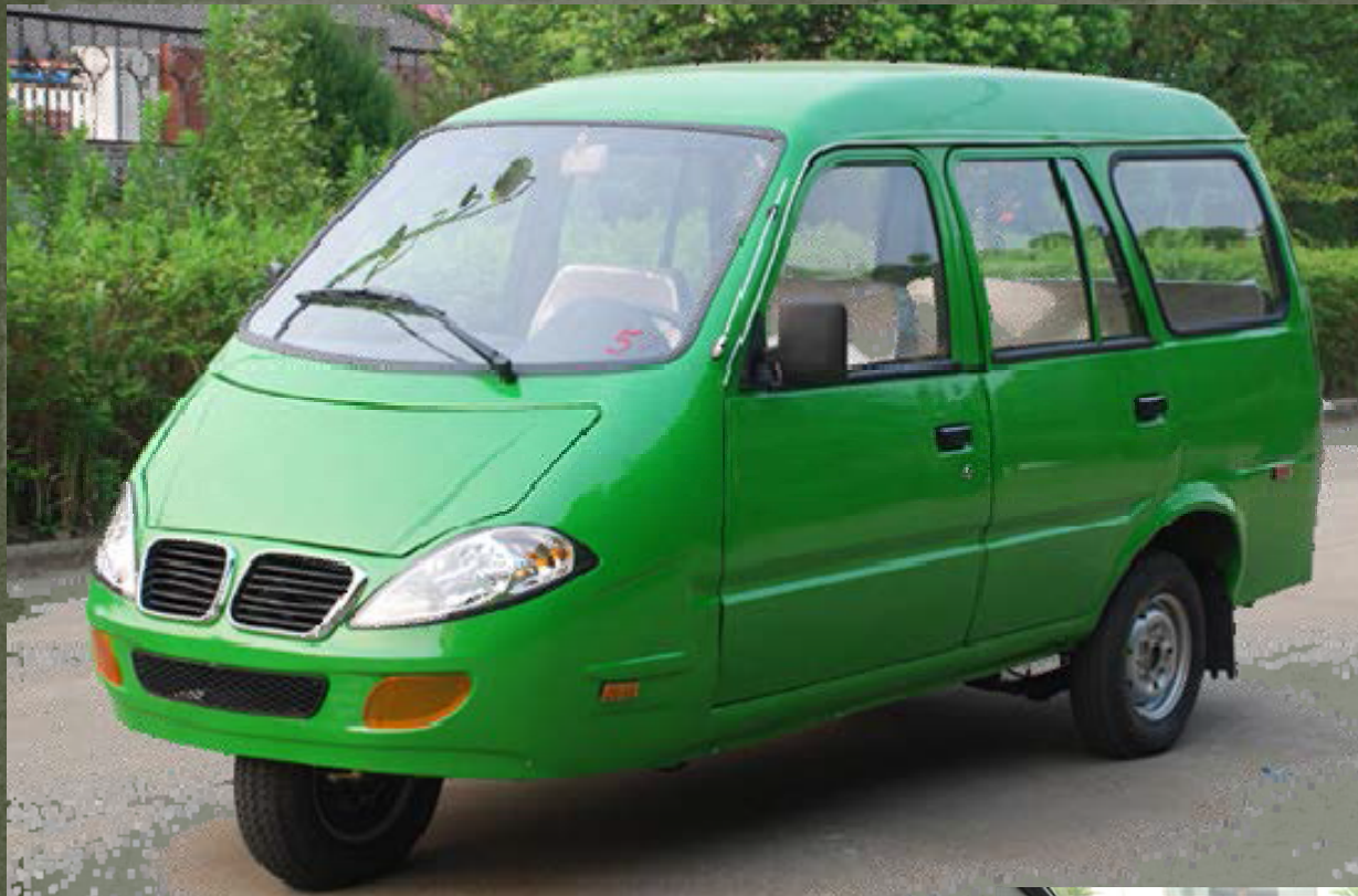
Trident 8 Seater Vanette