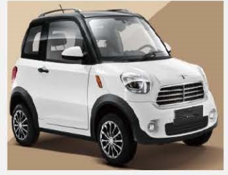
( Glacial White )