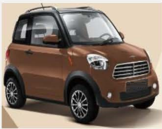
( Golden Brown )