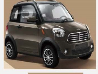
( Dark Grey )