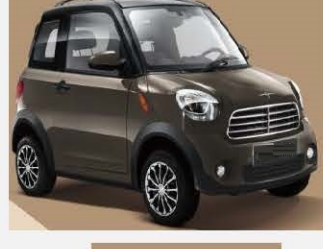
( Dark Grey )