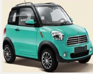
( Verdancy )