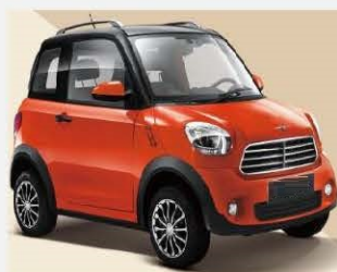
( Orange )