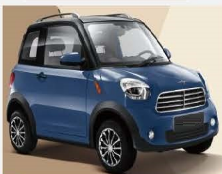
( Sapphire Blue )