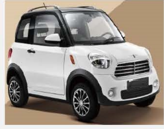
( Glacial White )