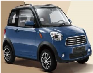
( Sapphire Blue )