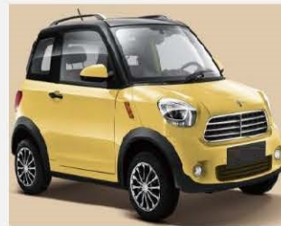
( Bright Yellow )