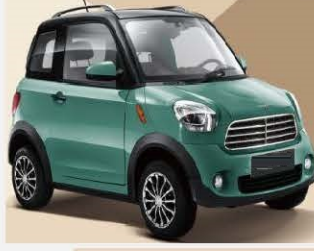
( Emerald Green )