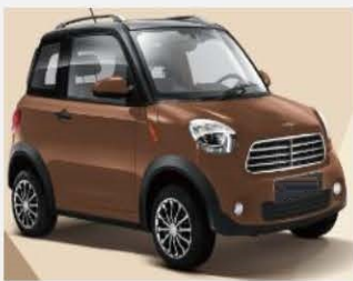
( Golden Brown )