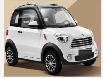
( Glacial White )