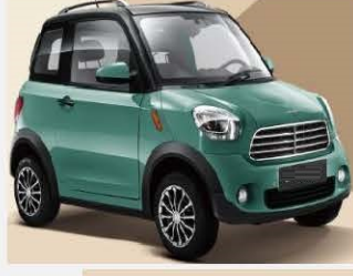
( Emerald Green )