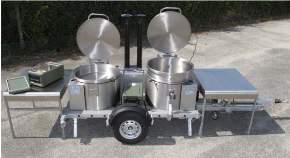
Cooking trailers Type I