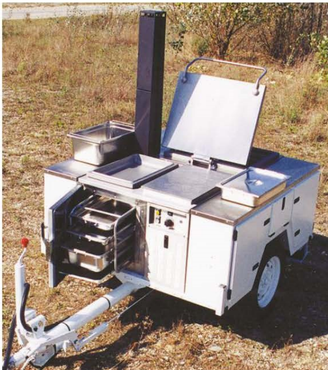
Cooking trailers Type II

Preparation of up to 50 meals within 1 hour.