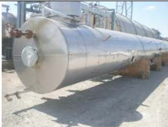
The facility overall appearance