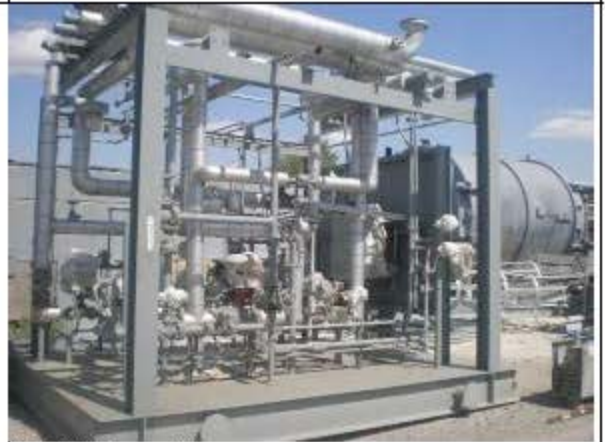
The facility overall appearance