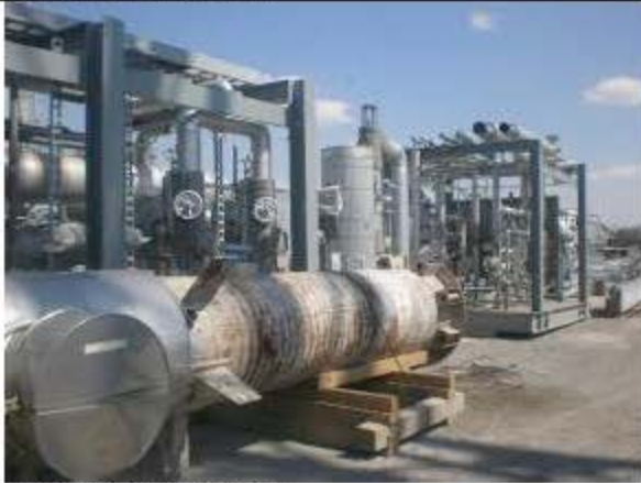
The facility overall appearance