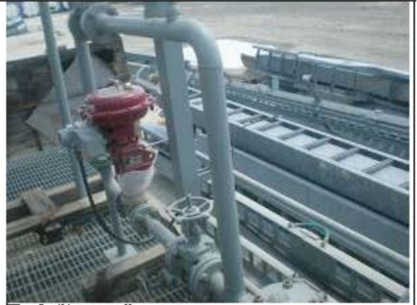
The facility overall appearance