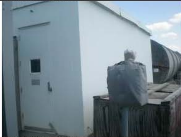
The facility overall appearance