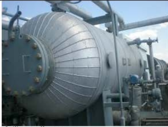
The facility overall appearance