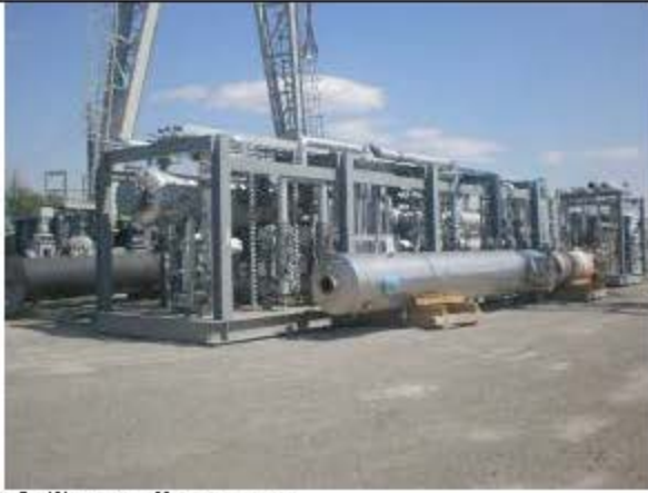
The facility overall appearance