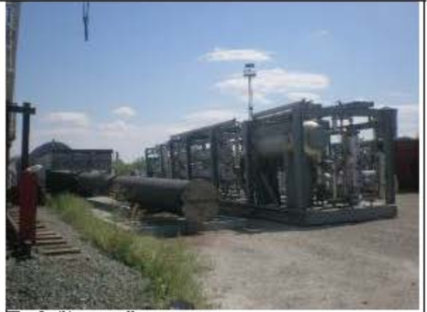
The facility overall appearance