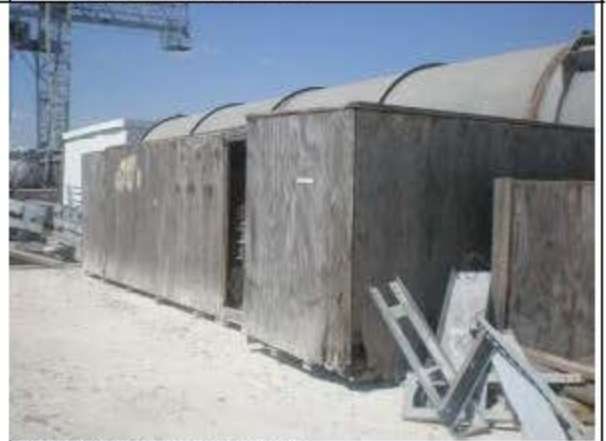
The facility overall appearance