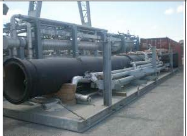
The facility overall appearance