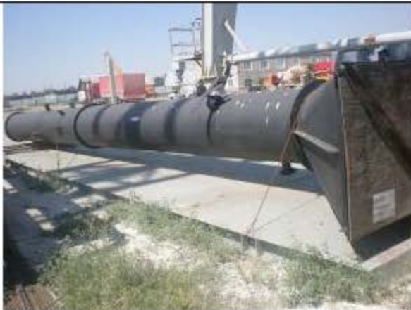
The facility overall appearance