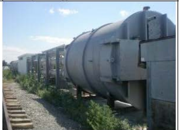
The facility overall appearance