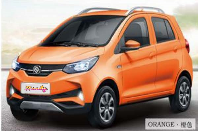
ORANGE · 橙色