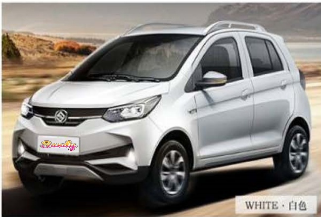
WHITE · 白色