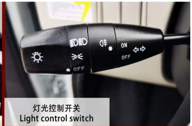
灯光控制开关 Light control switch