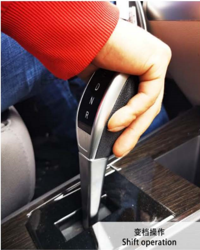
变档操作 Shift operation