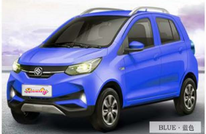
BLUE · 蓝色