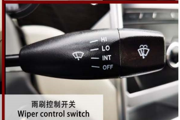
雨刷控制开关 Wiper control switch