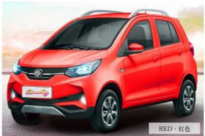
RED · 红色