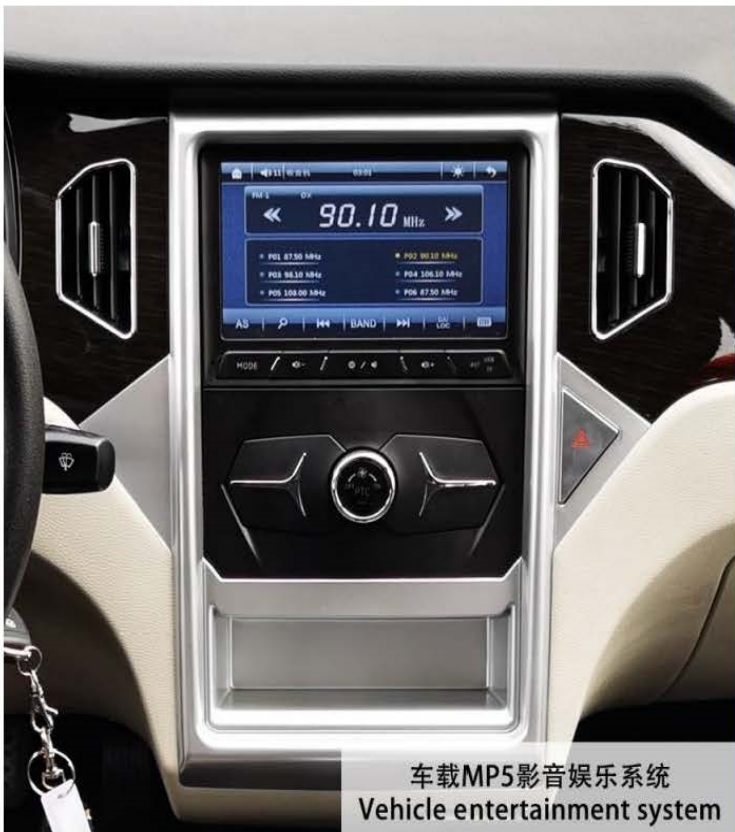
车载MP5影音娱乐系统 Vehicle entertainment system