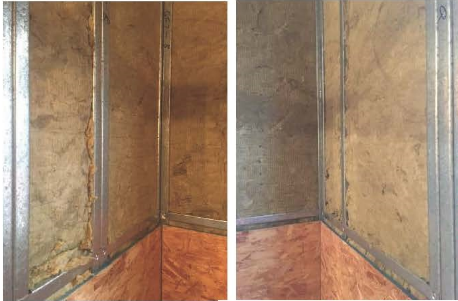
The installatio of the windows and doors.