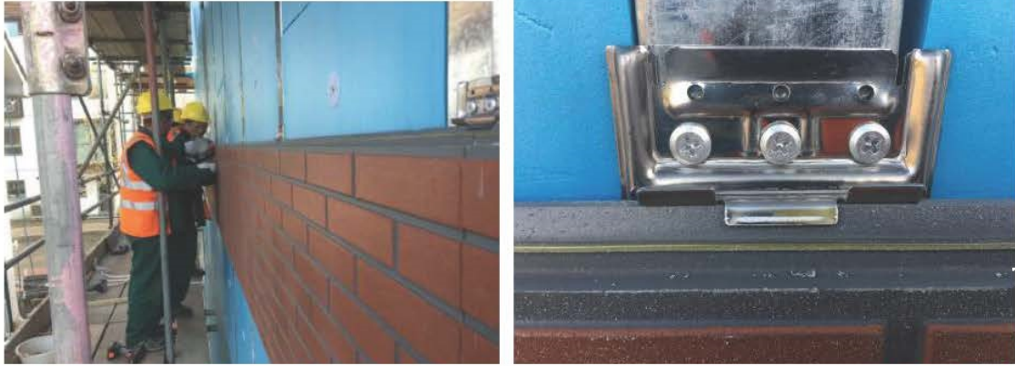
High density cement fiberboard and waterproof coating :