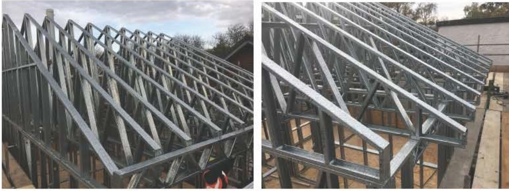
The installation of the OSB board and waterproof material for the roof.