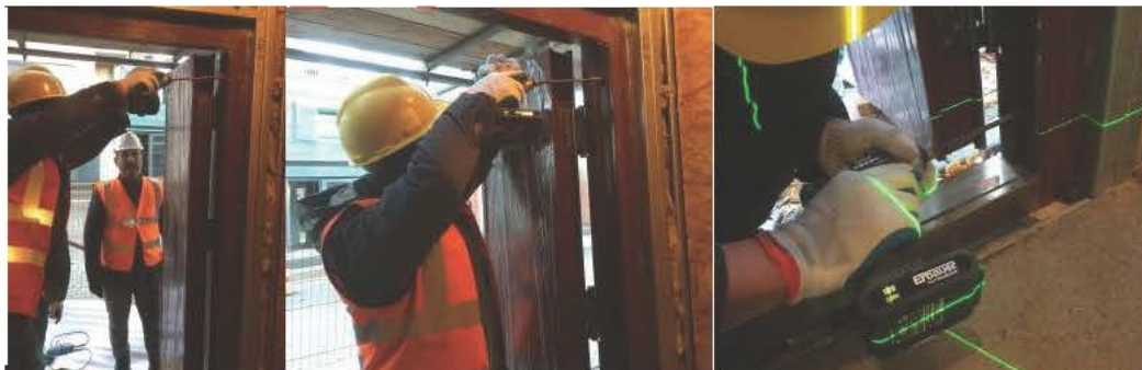
The installation of the OSB board for interior wall.