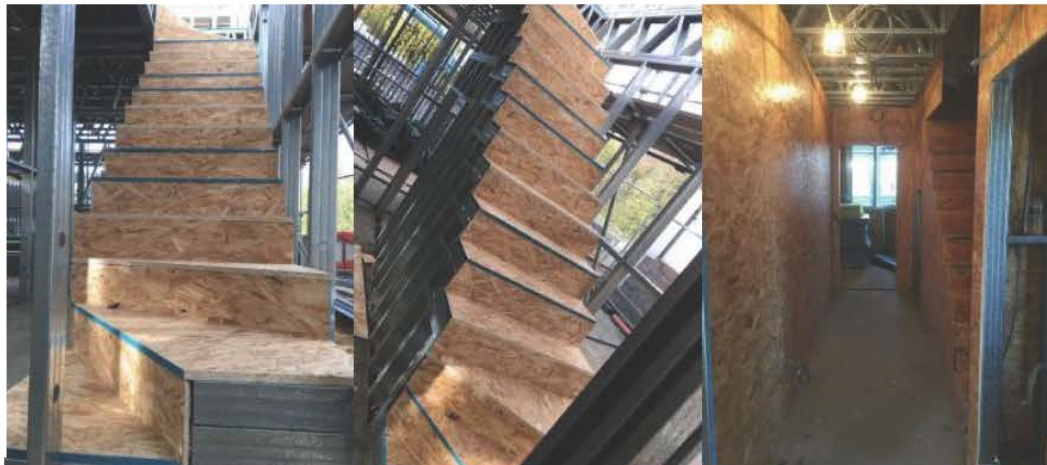
The installation of the thermal insulation board for the inside of the wall.