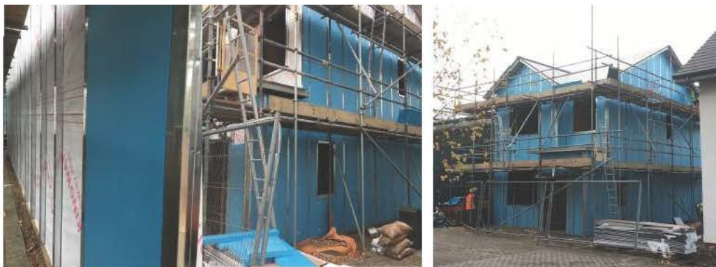
The guest use the brick-shaped cement fiber board for the first floor.