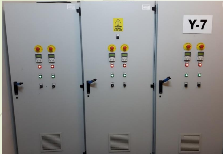
LOW VOLTAGE DISTRIBUTION PANELS