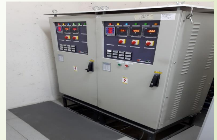
MEDIUM VOLTAGE DISTRIBUTION AND FEEDING PANELS