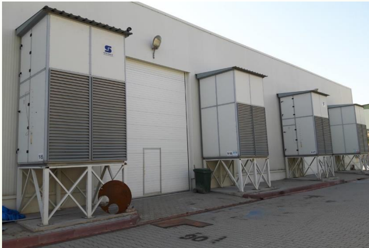
GENERATOR COOLING FANS