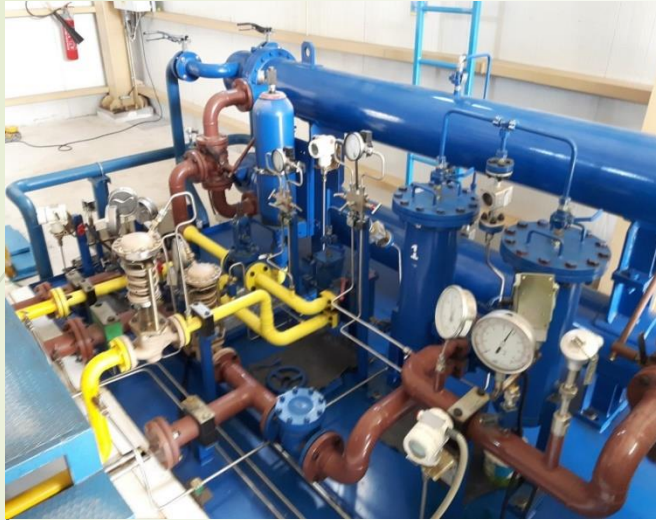
OIL COOLING SYSTEM