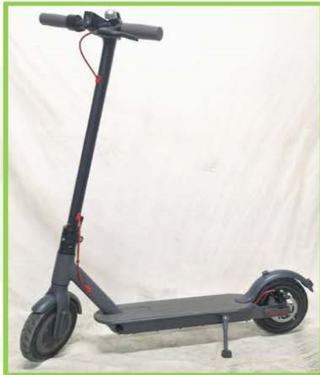
Model X1 250W 36V 7.8AH