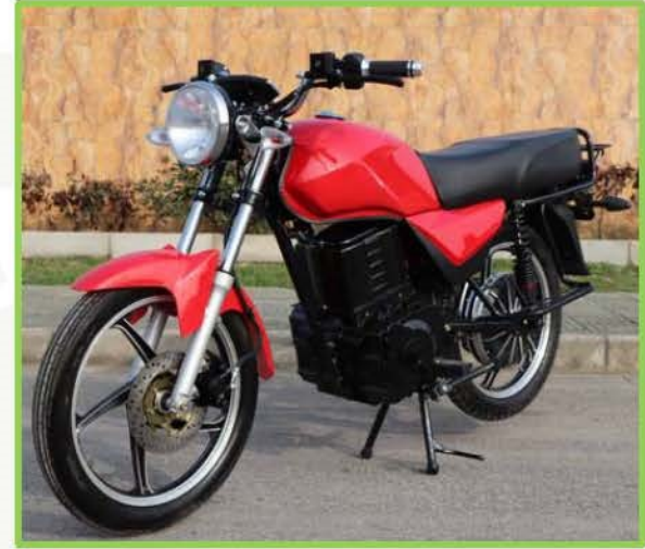
Model XBH 3000W 72V20AH