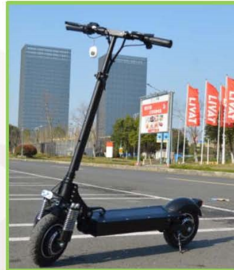
Model X3 350W 48V 10AH