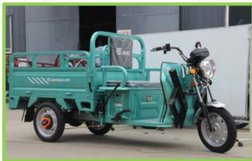
Electric cargo tricycles