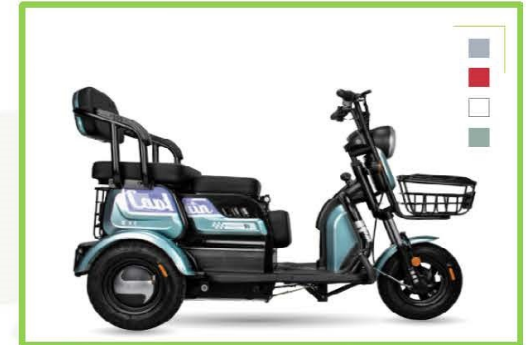
Urban leisure electric tricycle