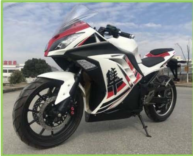
Model XRZ 3000W 72V20AH