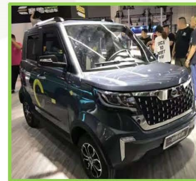
New energy electric cars