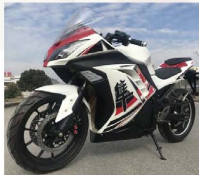
Racing electric motorcycles