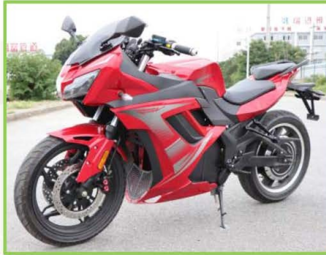
Model Beyond 3000W 72V45AH