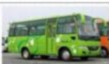
SLG6600C3E Rural bus 25-30 passenger seats minibus FOB Price: USD13,999-17,999/UNIT.