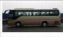
SLG6800C3FR city bus 43-47 passenger seats minibus FOB Price: USD39380-42,150/UNIT.