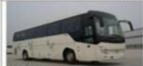
SLG6127C5ZR Long-distance bus 55-60 passenger seats minibus FOB Price: USD63800-68,590/UNIT.