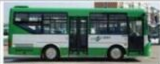
SLG6750C3GF BRT city bus 27/30 Capacity BRT City bus FOB Price: USD18,599-23320/UNIT.