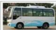
SLG6600C3F Rural bus 15-25 passenger seats minibus FOB Price: USD14,999-16500/UNIT.