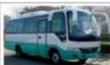
SLG6720C3E Rural-city bus 25-33 passenger seats minibus FOB Price: USD16,999-18500/UNIT.