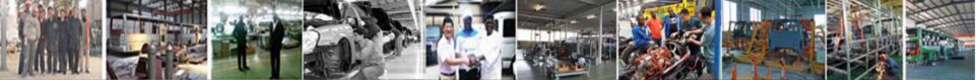
1, Syria SUV Plant | 2, Syria bus Plant | 3, Ghana SUV Plant | 4, Pakistan auto plant | west africa project | 6, Ethiopia Plant | 7, East africa bus plant | 8, Brazil Pickup plant | Monqolia bus plant