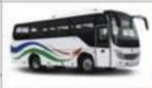
SLG6840C3E Long-distance bus 37-42 passenger seats minibus FOB Price: USD28560-29,999/UNIT.