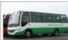
SLG6750C3F Rural-city bus 30-35 passenger seats minibus FOB Price: USD17999-18999/UNIT.