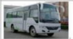
SLG6791C3Z Rural-city bus 35-38 passenger seats minibus FOB Price: USD21,499-24999/UNIT.