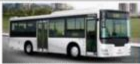
SLG6800C3GFR BRT city bus 33/30 Capacity BRT City bus FOB Price: USD29,999-34500/UNIT.