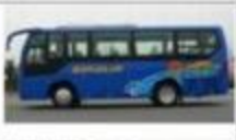
SLG6800C3E Rural-city bus 35-40 passenger seats minibus FOB Price: USD27,500-29480/UNIT.