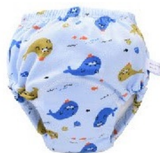
Cloth training pants