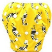
Baby cloth swimming pants