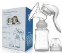
Mom breast pump