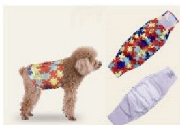
Pet cloth diapers