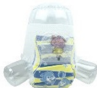
Disposable swimming pants