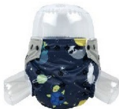
Baby cloth diaper