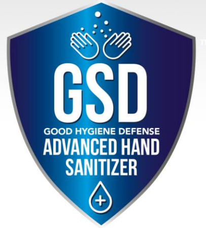
Antibacterial Hand Sanitizer Gel and Liquid