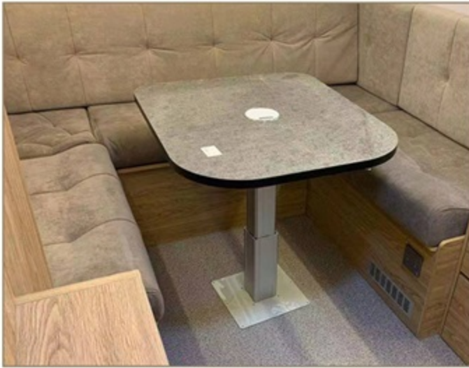
Adjustable table, U-shape sofa (changeable bed)