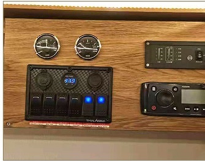
Push-button switch panel