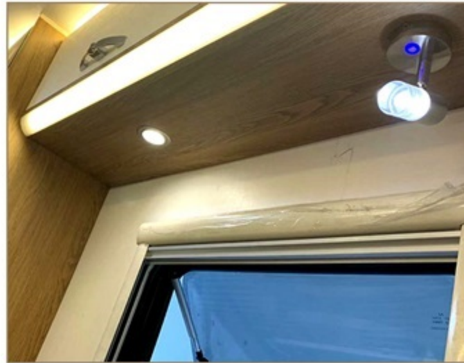
Air conditioning+ reading lights