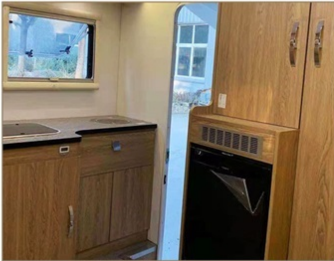
Induction cooker+washing sink +refrigerator