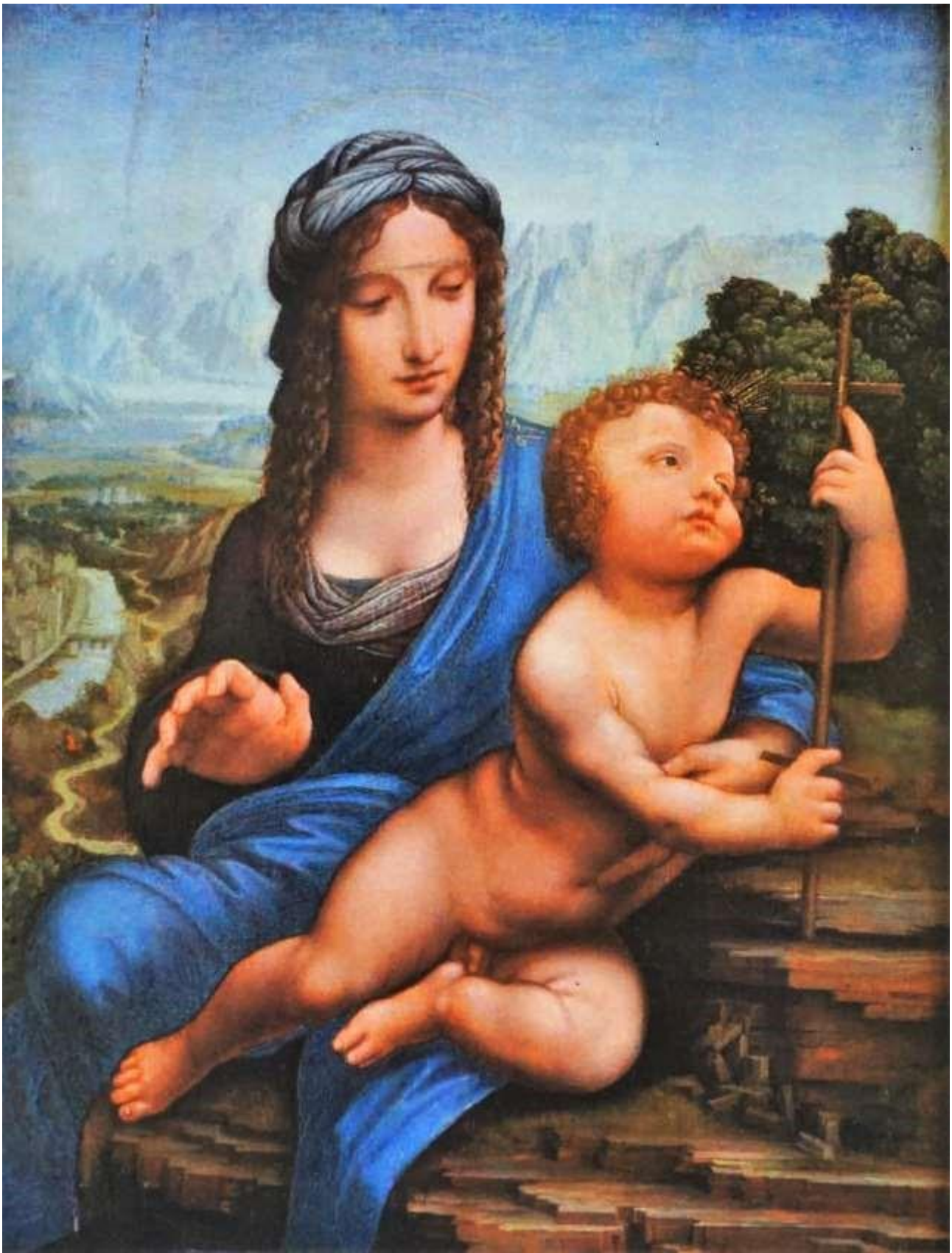
"Madonna of the Yarnwinder" (The Crespi Madonna) ca. 1510 by Leonardo Da Vinci (1452-1519) Oil on panel 17.1 x 13.7 in