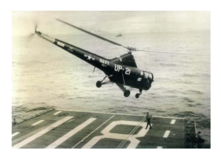
Sikorsky HO3S-1 On a Aircraft Carrier Ship in takeoff phase during the Korean War of 1950