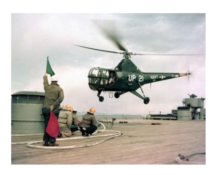
Sikorsky HO3S-1 On a Aircraft Carrier Ship in takeoff phase