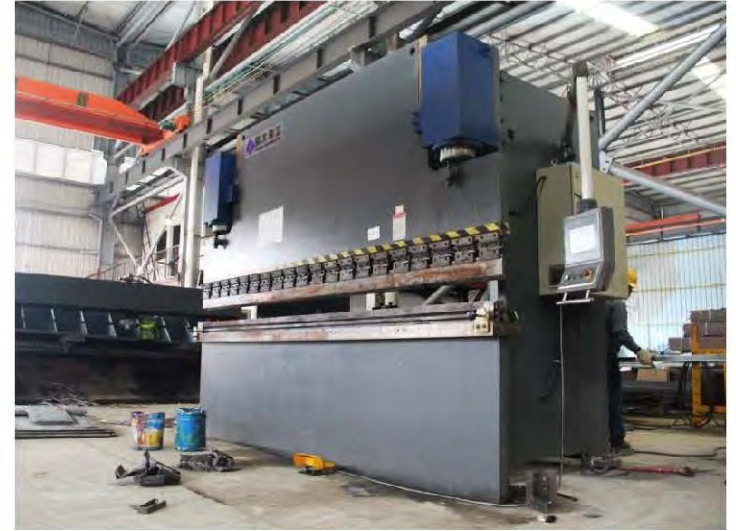
SHEARING AND CUTTING

Owned many self-developed modern automatic production lines.