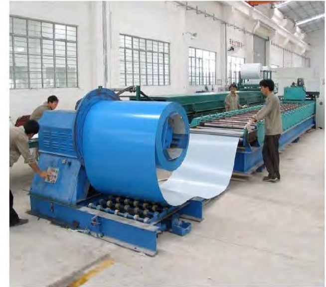
TILE MAKING MACHINE

Annual output for civil and industrial construction is 300,000 m 2 , for steel plates is around 200,000 m 2 . The annual production and installation capacity is more than 200,000 m 2 .