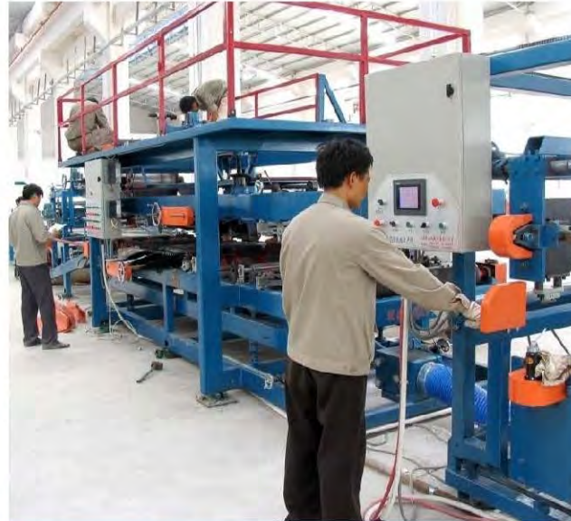
PLATE CUTTING MACHINE