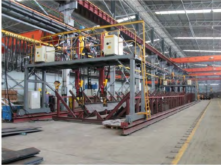
H TYPE STEEL WELDING