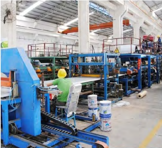
PLATE CUTTING MACHINE