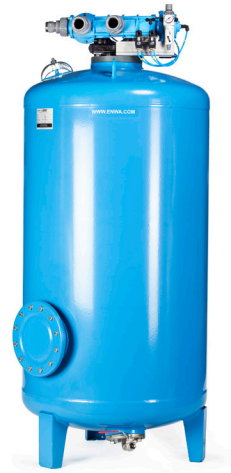
Sandfilter SA-800 Thermoplastic coated vessel Automatic back flushing