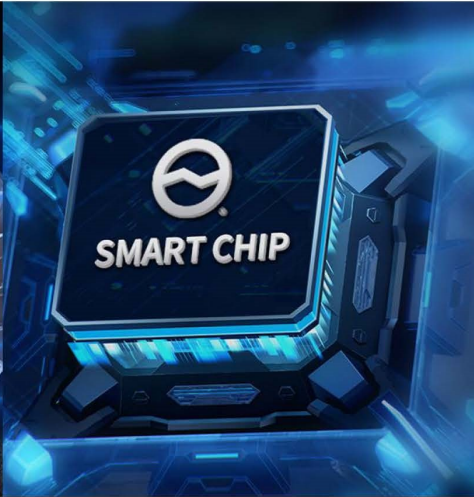
Intelligent circuit protection