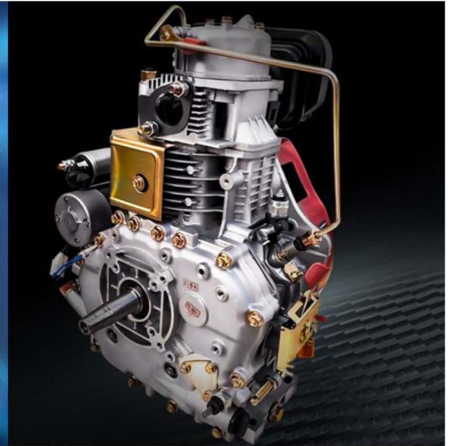
Powerful and Low noise