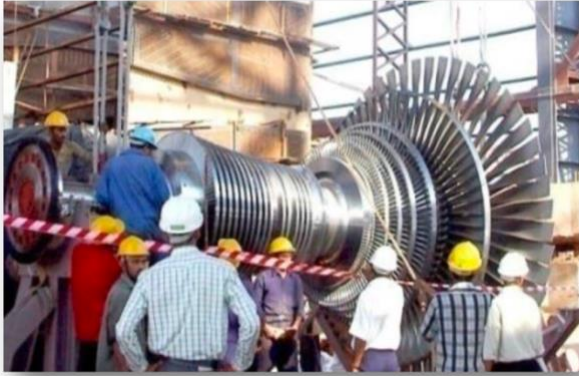
Alstom – Steam Turbine ST-F15 and Generator