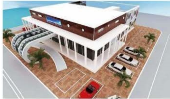
Build Chain 4S Store