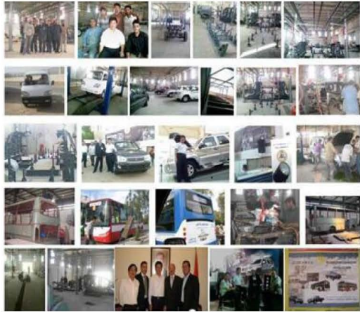
Pickup SUV CKD assembly line