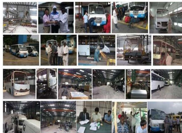
City Buses CKD assembly line