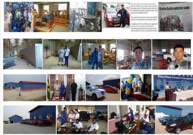
Saloon, Pickup/SUV CKD assembly Line