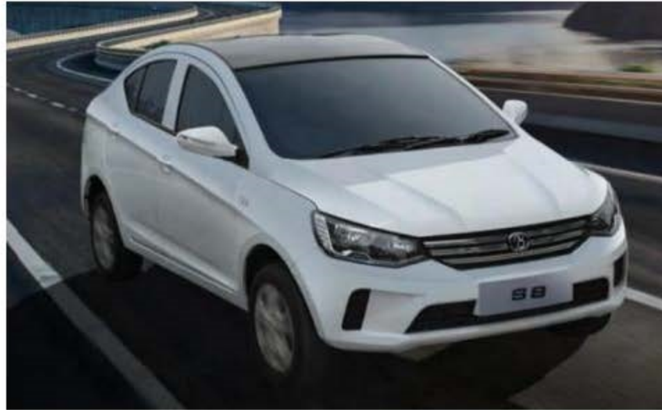
Electric Solar Car S8