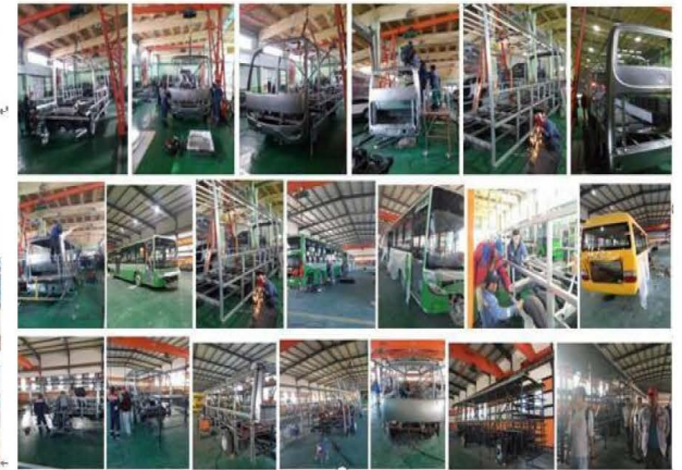
Electric Buses line in Mongolia