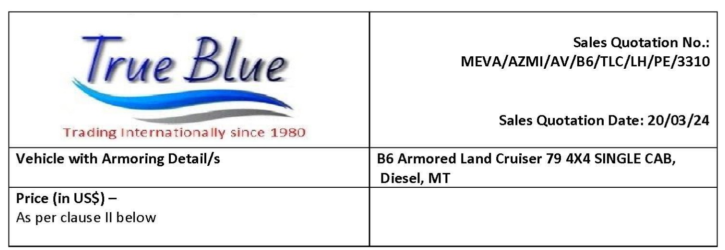
This proposal is for the supply of B6 Armored Land Cruiser 4X4 79 SINGLE CAB: