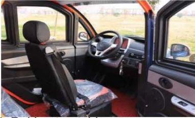
1. Rubber turntable