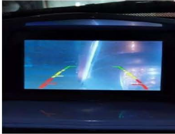
4.Rear view camera