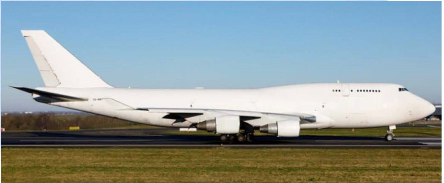
Approximate Range for Boeing 747-400BCF from New York, USA (Subject to winds and weather)