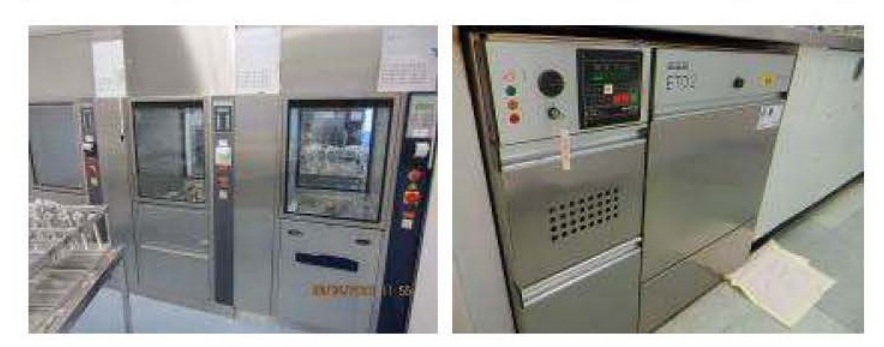
Position 01: Central Sterilization Section