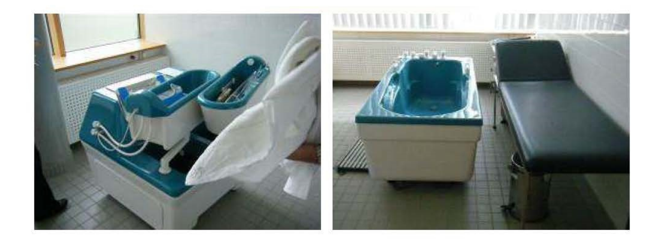
Position 13: Station Furnishing