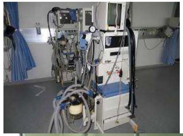
Position 03: Anesthesia Recovery Room