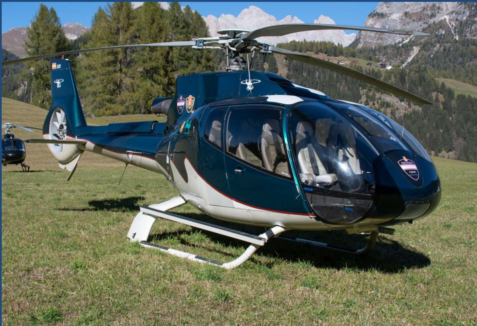
EC130B4 – 2002