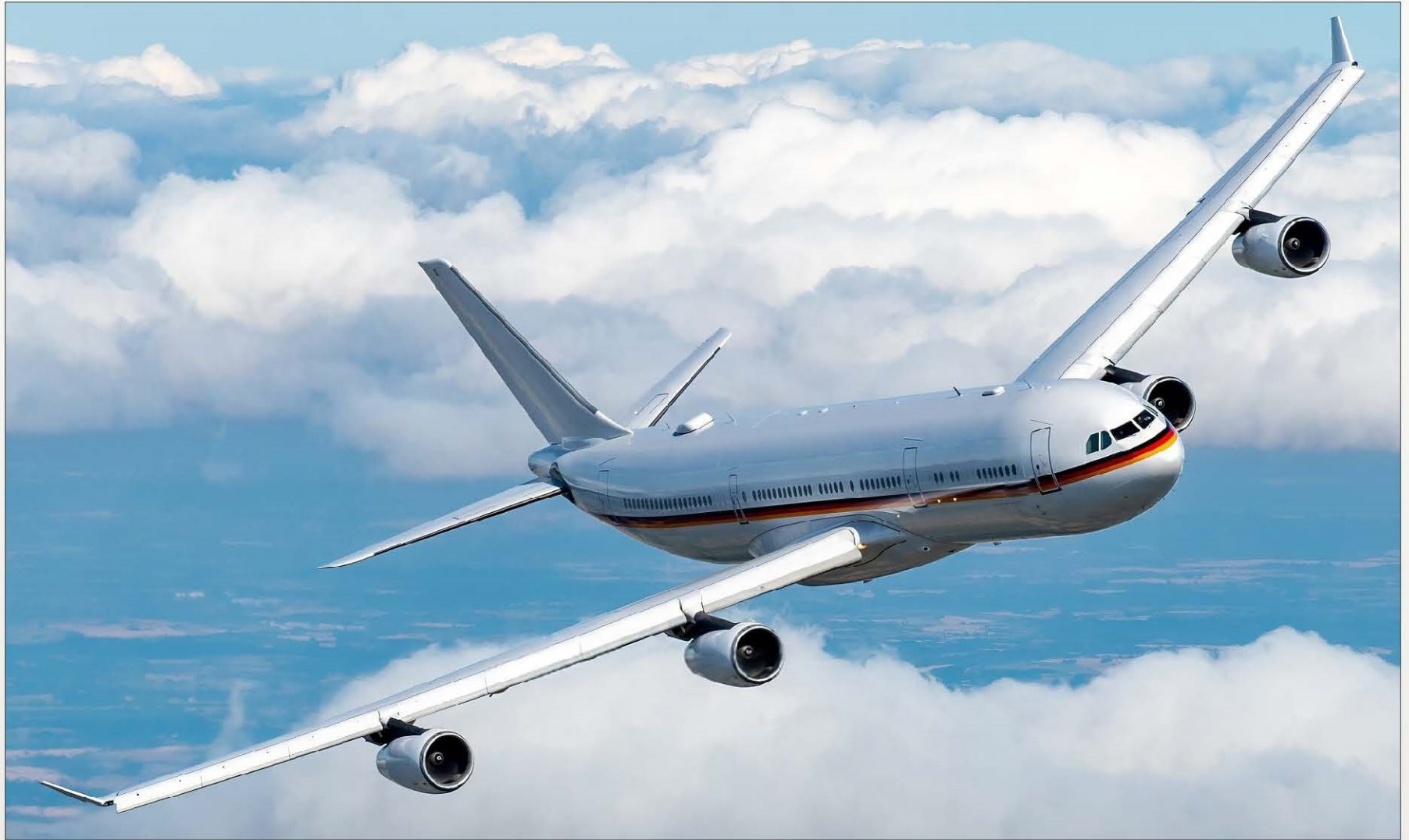
Executive Airbus A340-300