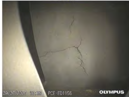
LP Vane converging cracks.