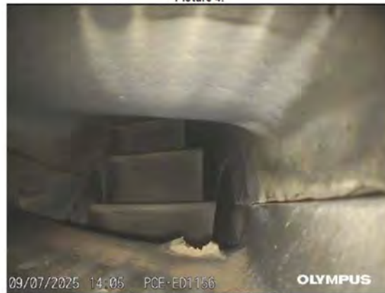
HP Vane coating blistered and spalled.