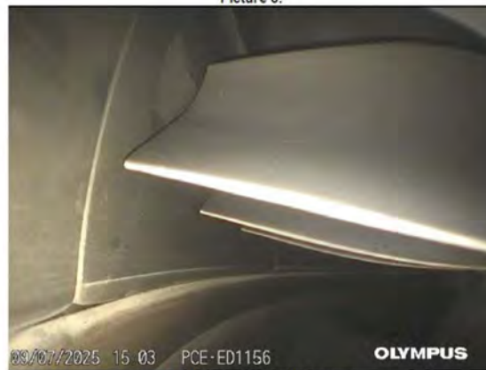
Light rubbing marks on LP Shrouds.