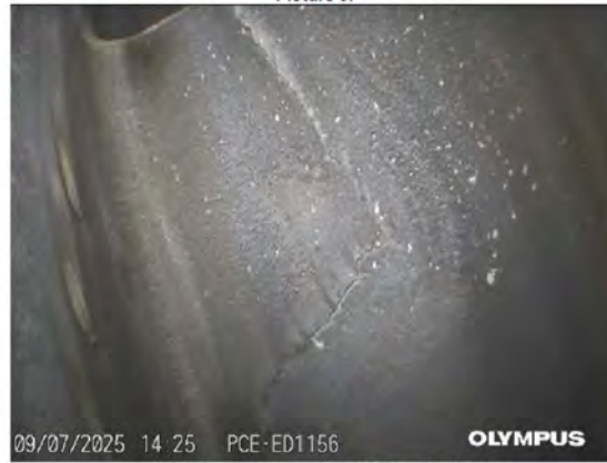
Axial and radial converging cracks on HP Vane